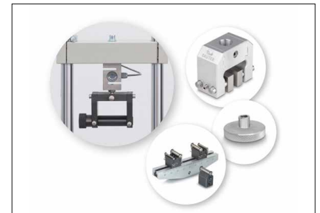
Solid and flexible fixing options for many clamps and accessories from the SAUTER product range, see Accessories